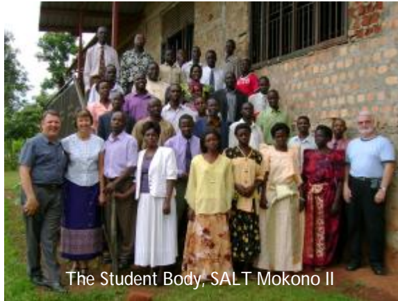
The Student Body, SALT Mokono II

In Mokono, our second SALT School is being conducted for the Baptist Union of Uganda, Central Region. In January, 35