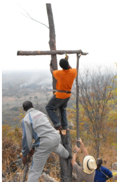
Claiming the Land. Erecting a cross on the top of Fiwale Hill prior to the Conference

And the work continues in the hearts of many people. The work was deep and we are certain that God has begun something in the life of the churches He intends to take much further.