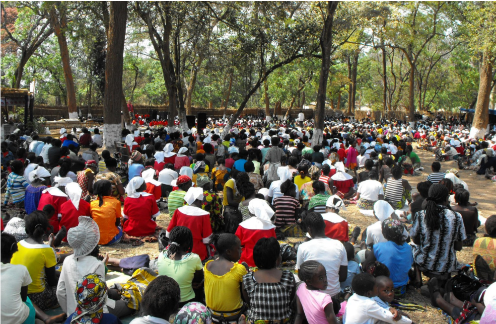
Photo Gallery from the Conference at Fiwale Hill in Zambia

A crowd of over 2000 people gathered at Fiwale Hill Mission for the Conference. They sat on the ground for hours to listen to the preaching and teaching.